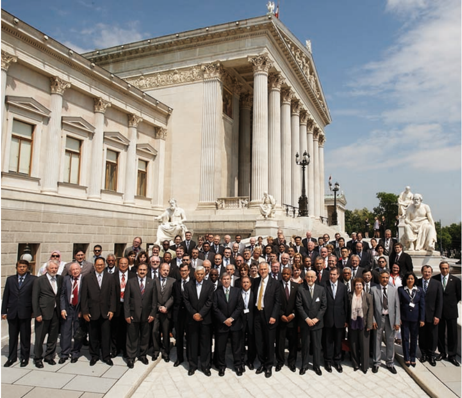
Participants of the Conference on Strengthening External Public Auditing in INTOSAI Regions 26 – 27 May 2010, Vienna