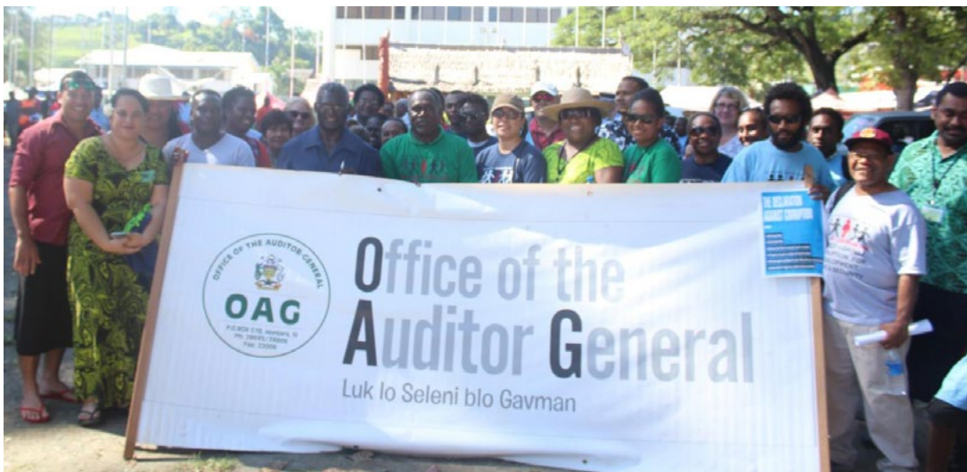
Photo above: PASAI/PFTAC workshop participants join the Anti-corruption march in Honiara.

PASAI acknowledged the financial support of the Australian Government Department of Foreign Affairs and Trade (DFAT) and the New Zealand Ministry of Foreign Affairs and Trade (MFAT) and the collaborative ongoing joint regional partnership with PFTAC.