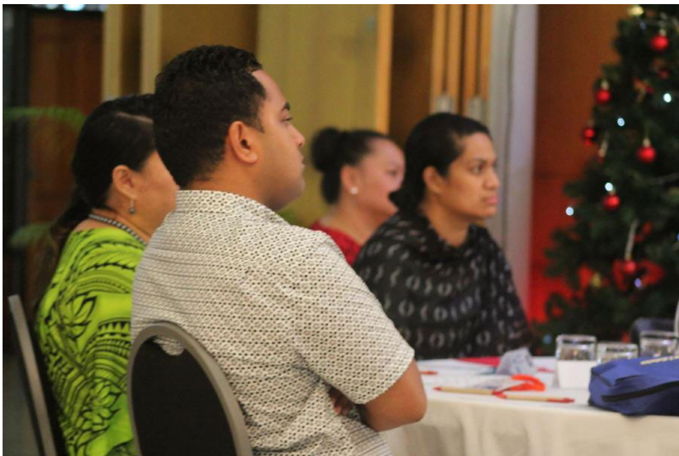
Photo above: Participants of the Pacific regional program on public procurement in Apia, Samoa.