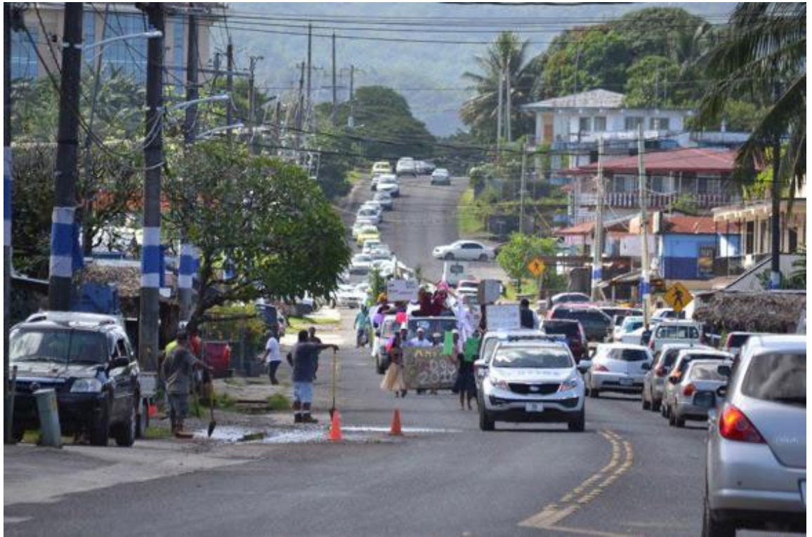
Photo above: The march taking place down the main street of Pohnpei, FSM.