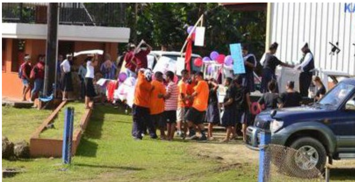
Photo above: Preparations for the Anti-Corruption march in Pohnpei, FSM.

Their programme for the day included a float parade down the main streets of Pohnpei, followed by a short ceremony.