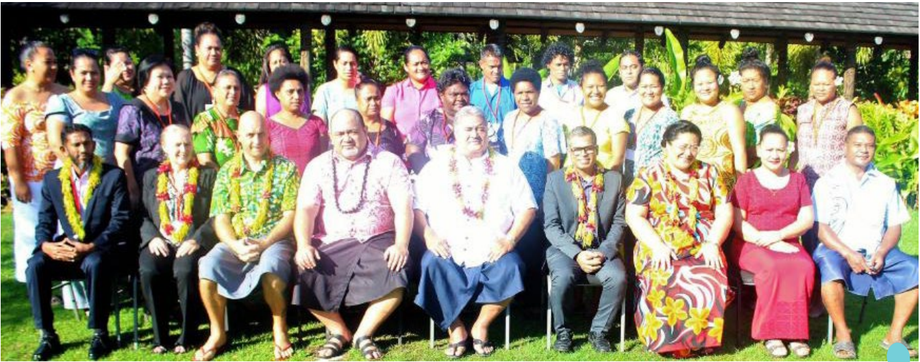
Photo above: Participants of the Pacific regional program on public procurement in Apia, Samoa.

for the external government audit community and has a worldwide global affiliation with SAIs around the world. PASAI acknowledged the financial support of the Australian Government Department of Foreign Affairs and Trade (DFAT) and the New Zealand Ministry of Foreign Affairs and Trade (MFAT) and the collaborative ongoing joint regional partnership with IDI.