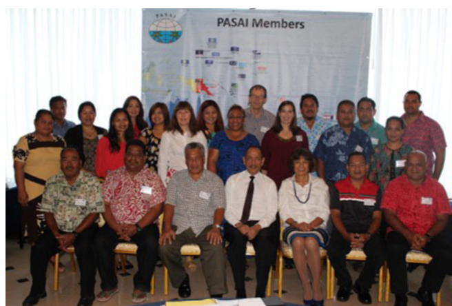
Photo: SAI PMF workshop participants and co-ordinators at the Guam workshop.

This project is supported by Australian Department of Foreign Affairs, INTOSAI Development Initiatives (IDI) and New Zealand Ministry of Foreign Affairs and Trade.