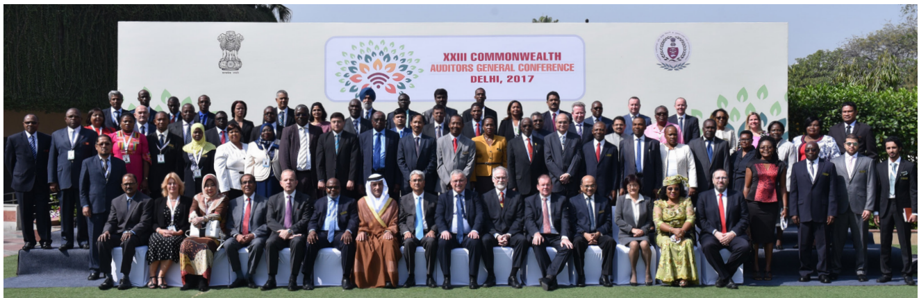
Group Photograph of Delegates attending the 23rd Commonwealth Auditors-General Conference, Delhi, India from 21-23 March 2017

Ajay Nand, Auditor-General of Fiji attended the 23rd Commonwealth Auditors-General Conference, which was held in New Delhi, India from 21-23 March 2017. The Conference's main theme was "Fostering Partnerships for Capacity Development in Public Audit." A total of 74 delegates from 36 countries attended the Conference, which included Auditors-General and staff from PASAI member countries of Australia, Fiji, Papua New Guinea, Samoa, Solomon Islands and Tonga.