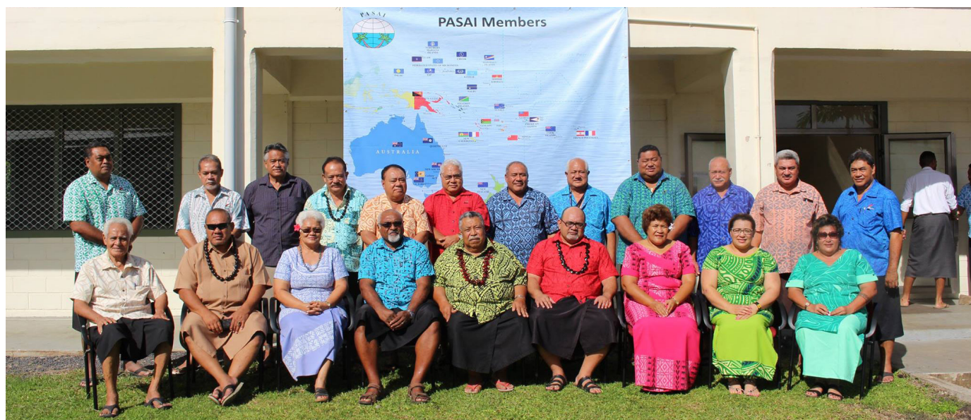
Photo above: Workshop Participants from Parliamentary Committee members of Samoa, the Controller and Auditor-General of Samoa and the PASAI Advocacy team.

This programme comes under Strategic Priority 2 - Advocacy for governance, accountability and transparency of PASAI's long-term strategic plan. PASAI appreciates the assistance provided by the Auditor-Generals, the Honorable Speakers of Parliament, and also acknowledges the valued support from the Australian Department of Foreign Affairs and Trade and the NZ Ministry of Foreign Affairs and Trade.