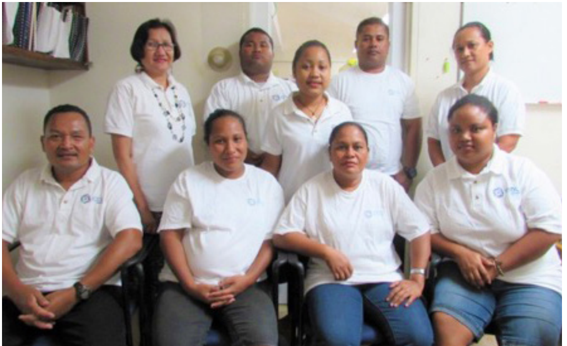
Photo: FSM State of Yap Public Auditor and his staff wearing ICDL promotional shirts

GUAM has two ICDL Accredited Testers and they had expected to commence certification assessment of their staff during August and September 2016, however this did not occur.