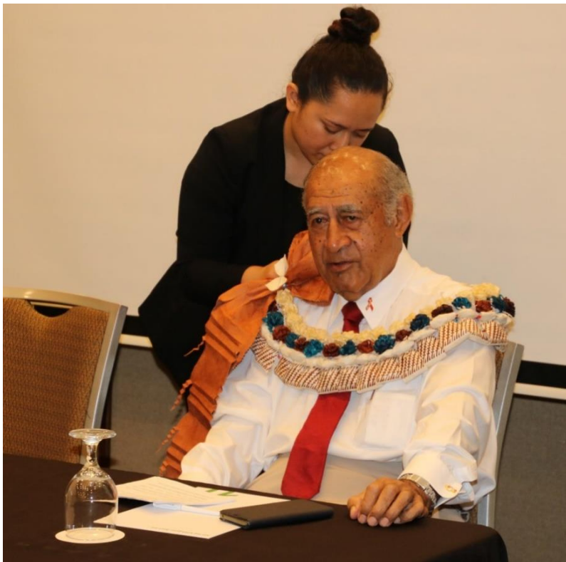
Honorable Speaker of Parliament, Ratu Epeli Nailatikau, who opened the workshop