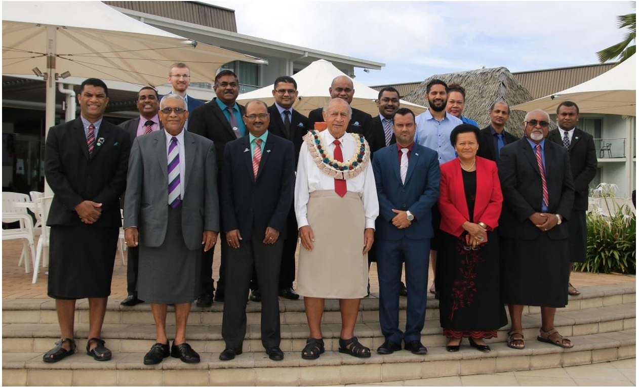
Attendees of the PAC workshop 4-5 June 2019