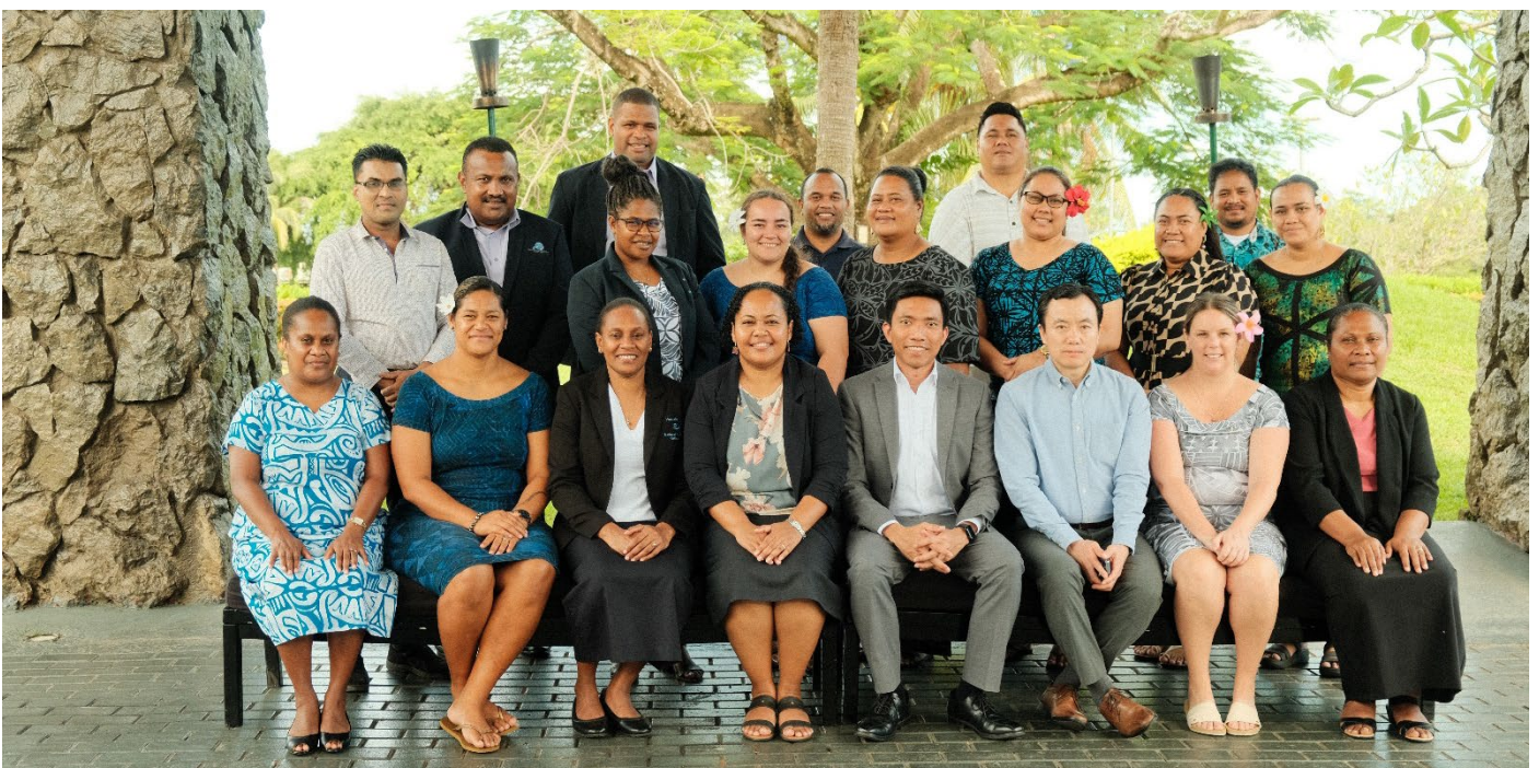
SoAQM workshop participants and facilitators in Nadi, Fiji

PASAI acknowledges the support of the New Zealand Ministry of Foreign Affairs and Trade (MFAT) and the Australian Department of Foreign Affairs and Trade (DFAT).