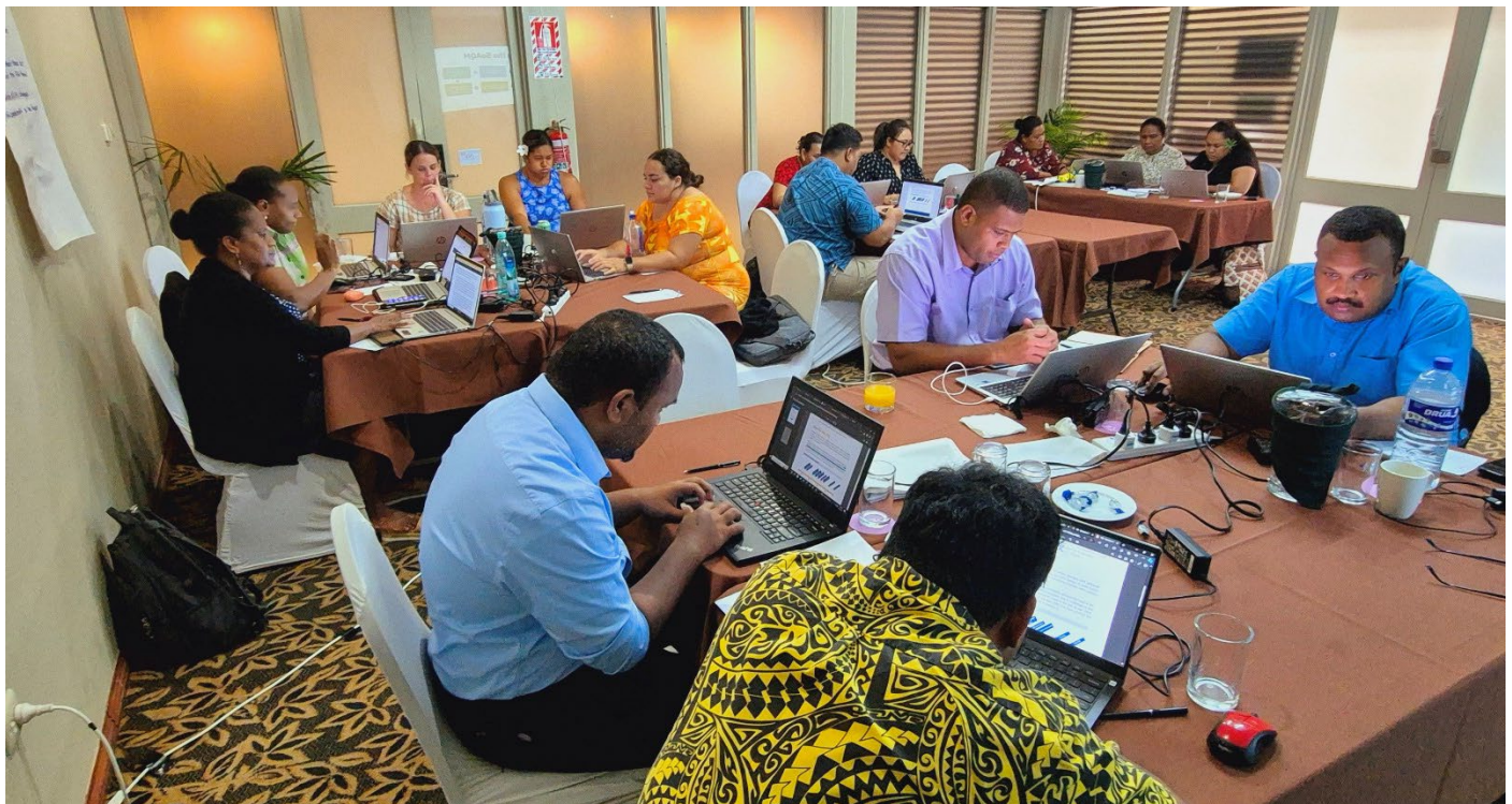
SoAQM workshop participants during training