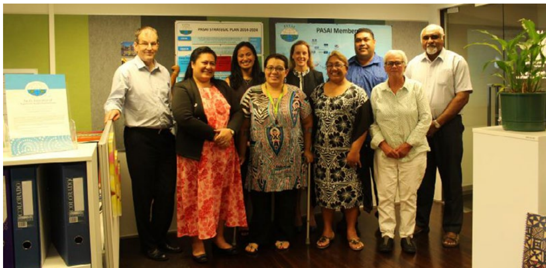
Photo above: The PASAI Secretariat team at the Secretariat office in Auckland, NZ.

The outcomes from this meeting will help to formulate program proposals for PASAI's Operational Plan 2017/18 – 2019/20 and related budget which will be submitted to the upcoming PASAI Governing Board meeting on 23-24 February 2017. The plan will also be a basis for funding discussions with donors.