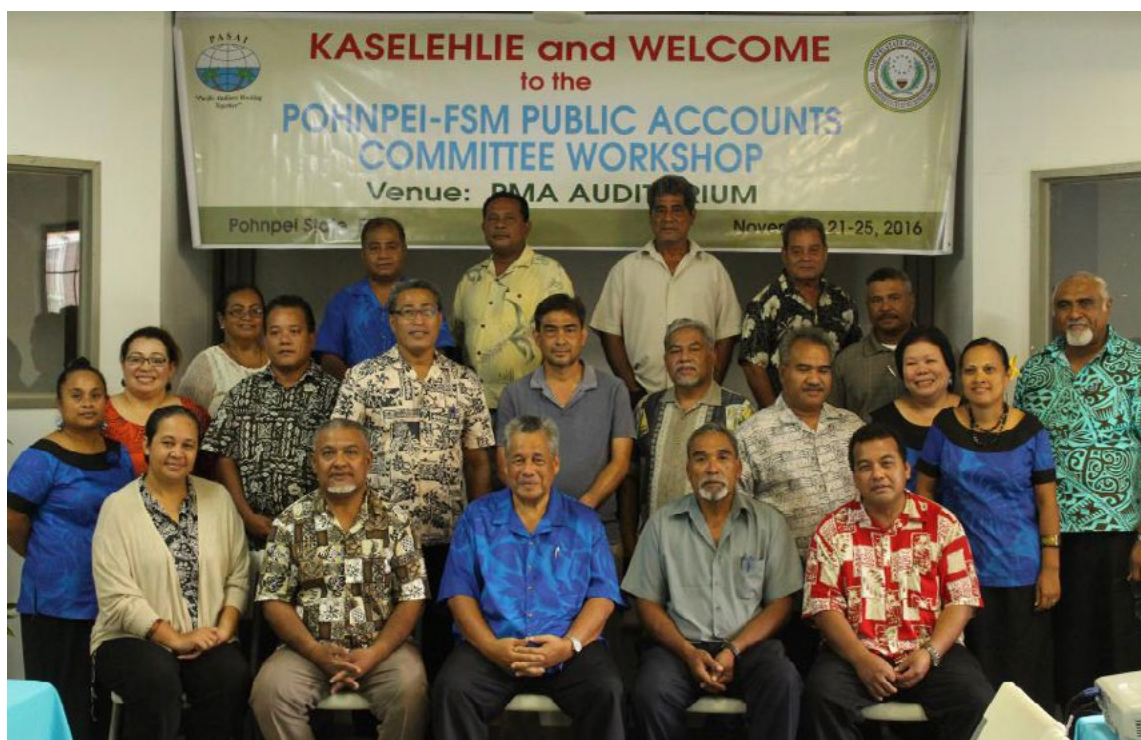
Photo above: Members of the Pohnpei State Legislature with staff of the Pohnpei Office of the Public Auditor and PASAI consultants.

PASAI would like to acknowledge the support of the Pohnpei State Office of the Public Auditor, for making this workshop a great success. We would also like to acknowledge the financial support of the Australian Government Department of Foreign Affairs and Trade (DFAT), and the New Zealand Ministry of Foreign Affairs and Trade (MFAT).