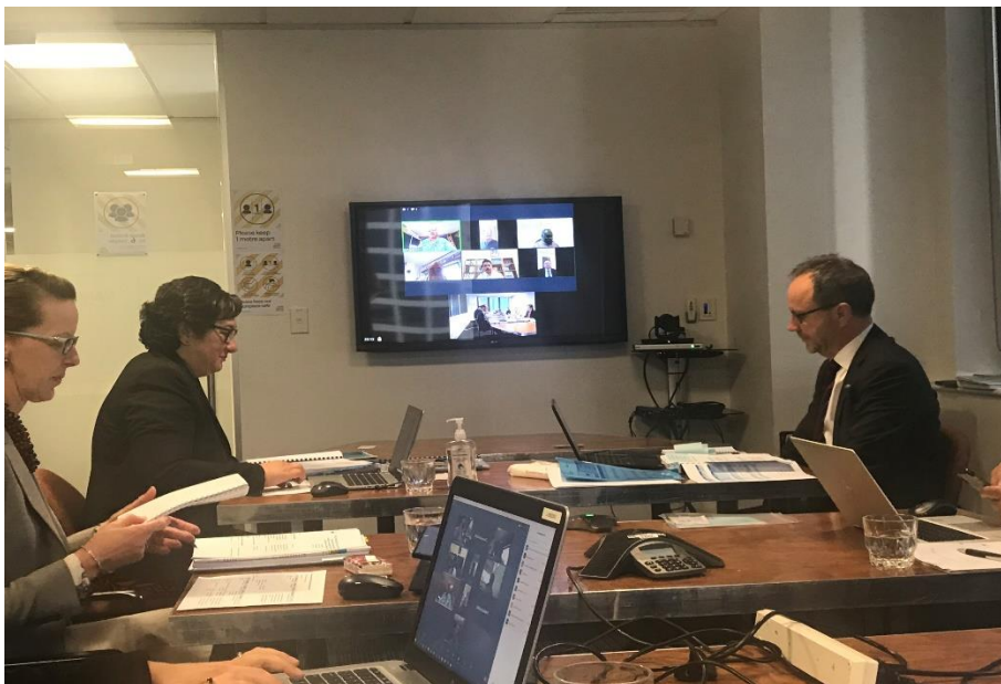
The 23 rd Governing Board online meeting in session

The Governing Board discussed key strategic, governance, and operational matters and a proposed suite of programs designed in response to SAI needs, the results of the 'Supreme Audit Institution Performance Measurement Framework' and the COVID 19 situation. The Secretariat's transition towards adopting a blended learning training model, with a short-term focus on online learning was also discussed. The Board was updated on the Secretariat's Digital Transformation program including the set up of a Learning Management System and the digitalisation of inhouse Business Intelligence function to strengthen monitoring, evaluation and reporting activities.