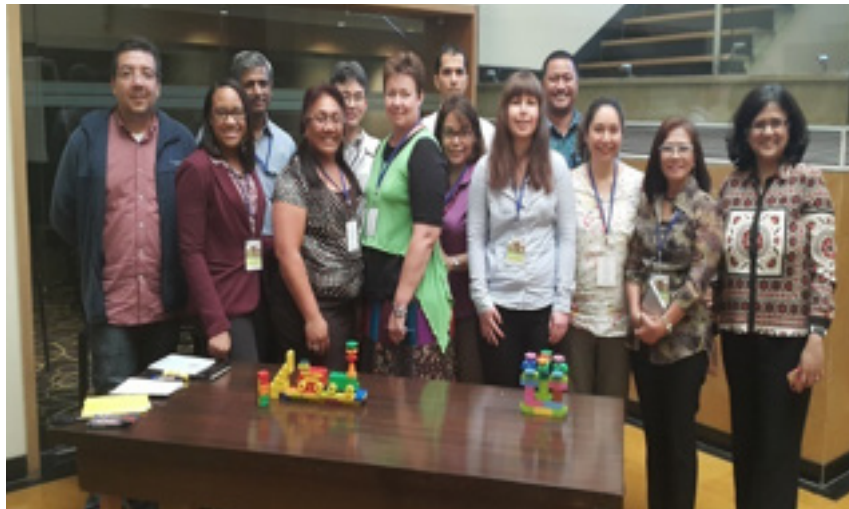
Delegates for the product development meeting: E-learning Handbook, New Delhi, India

"... The eLearning handbook will assist SAls and regions to make decisions about engaging with eLearning."