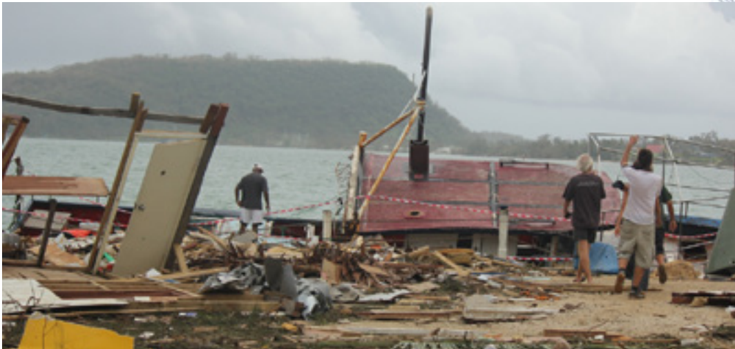
The clean up on the waterfront begins.

destruction never seen before in Vanuatu and on Saturday even though Shefa was still under red alert, people came out of their hiding places to witness the damage and it was devastating. On Sunday, it was pretty much the same thing. I think everyone was in a state of shock to see that their once beautiful town resembled a war zone and the green landscape is now a barren mess of dead vegetation. But like hope falling from heaven, the first signs of help could be heard in the skies from the New Zealand Hercules. Vanuatu's close neighbours (Australia and New Zealand) were on standby to lend a hand. Since then, we have seen army personnel from Australia, New Zealand, Fiji, Japan, France. Port Vila has been flooded with assistance abroad to work with local officials to assess the damage and administer assistance.