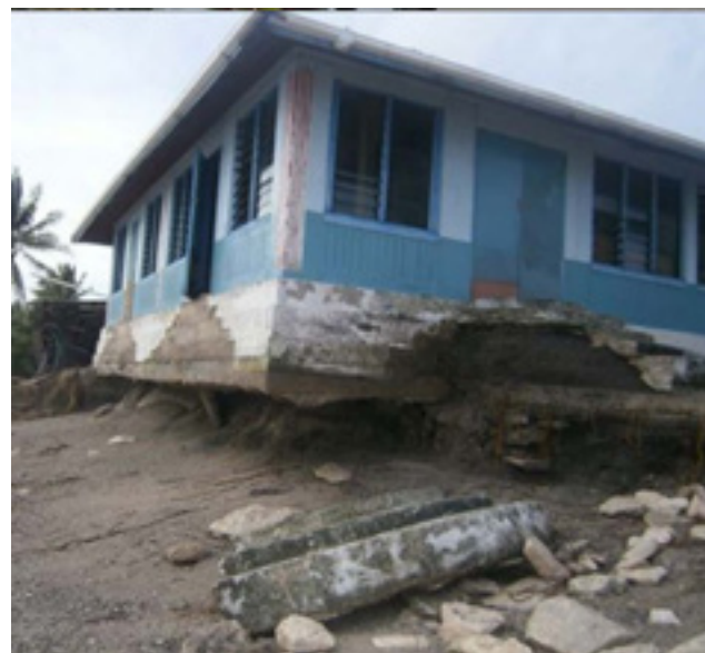
Lototahi at Nanumea Island.