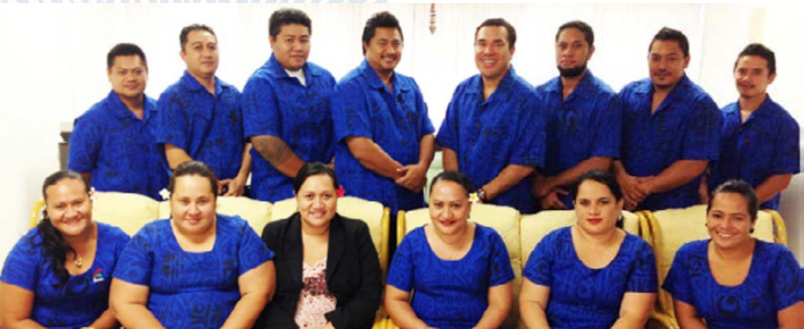
Certified fraud examiners in the Samoa Audit office

The ACFE is celebrating its 25th anniversary as the world's largest anti-fraud organisation and provider of anti-fraud training and education. With nearly 75,000 members worldwide, the ACFE is reducing business fraud and inspiring public confidence in the integrity and objectivity within the auditing profession. For more information, visit ACFE.com .