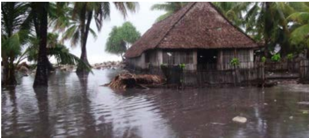
Kiribati storm surge as a result of Cyclone Pam.

It is important to remember that Vanuatu was not the only area affected by Cyclone Pam. Tuvalu, Kiribati and the Solomon Islands were all affected by storm surges and damaging winds, as these images show.