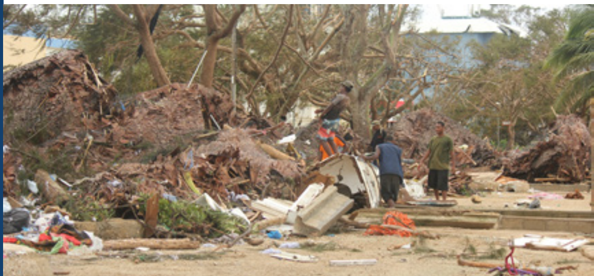
The remains of Mama Market

"All the trees were uprooted, which has marked the beginning of skyrocketing prices for scarce fruit and veges. A small cabbage was seen as selling for VT2000 or about $A23.00."