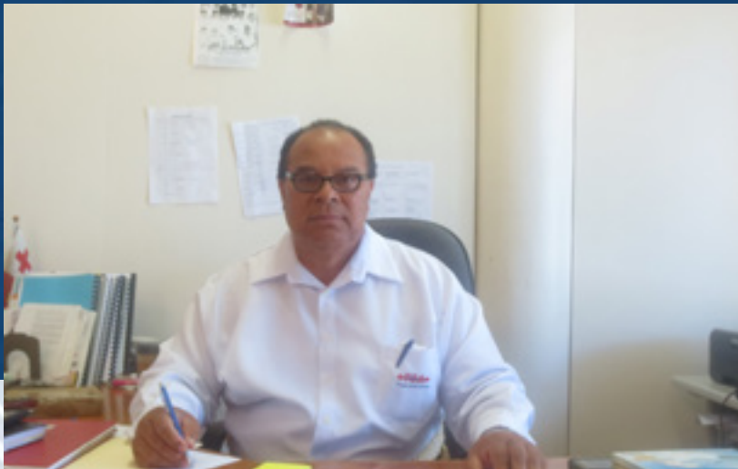
Dr Pohiva Tu’i’onetoa, after 31 years as the Auditor General of Tonga is now holding two ministerial portfolios in the Government of Tonga.

“Dr Tu’i’onetoa was a key figure in the formation of the South Pacific Association of Supreme Audit Institutions (SPASAI), the forerunner of PASAI.”