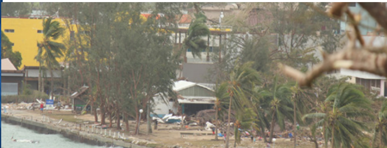
The battered seafront in Port Vila

Efate has a mix of Western housing, traditional housing and little shacks. The cyclone did not differentiate between the type of housing, but it was clear those that were poorly built bore the brunt of the storm. My cousin's rental place is a modern duplex up at Elluk and has beautiful views over Erakor Island. The walls are made of concrete and, from first appearances, looked like a building that would withstand a cyclone. She thought she would be safe. However, by 9 pm the roof started peeling off and the wind carried it over an elevated, two-storey home next door,