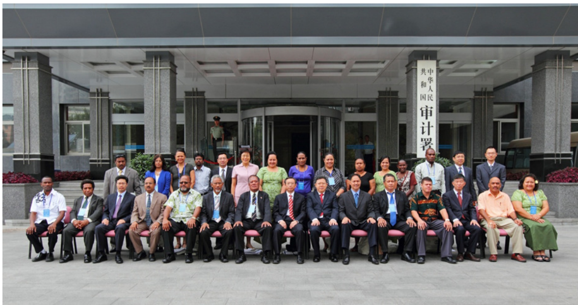
Group photo of the PASAI participants at the seminar on China's Economy, Political and Auditing Systems 30 August to 8 September, China