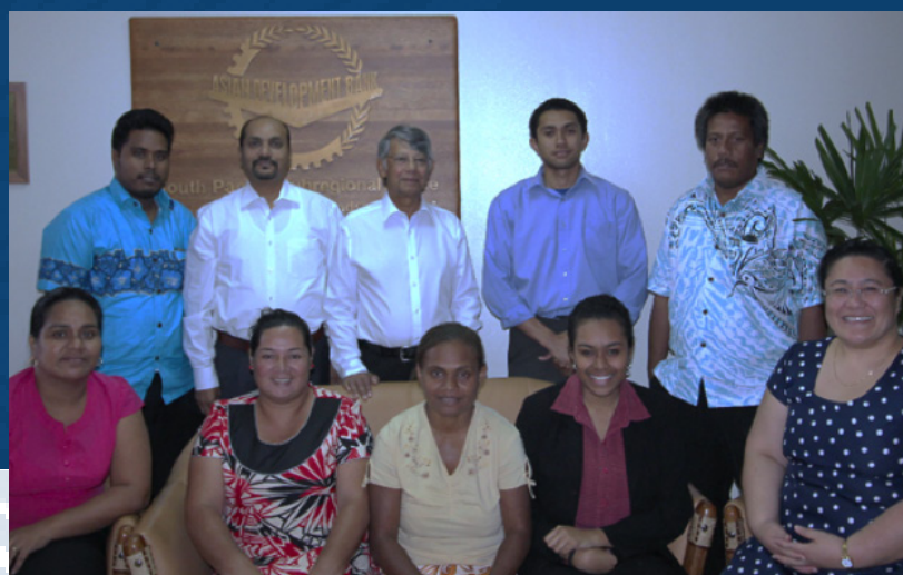
Participants with ADB Consultants — 3 staff from Kiribati, 1 staff from Solomon Islands, 1 staff member from Tuvalu and 2 staff from Fiji