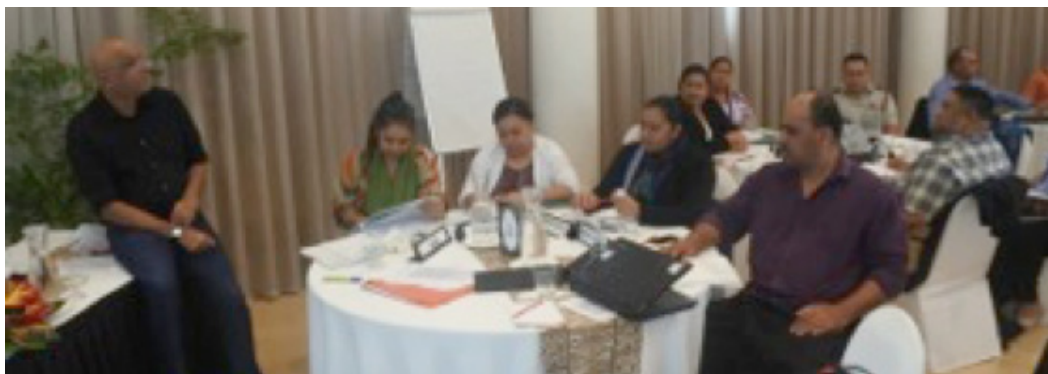
Photo: Professor Arvind Patel (left) discusses the application of an IPSAS with workshop participants.

It also covered the International Accounting Standards (IAS) 20 Accounting for Government Grants and Disclosure of Government Assistance . The use of cases from the Tonga Whole of Government and Public Enterprises accounts assisted the participants in the practical use of the standards.