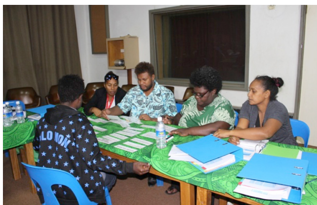
Photo above: Solomon Islands SAI participants engaged in report writing activity.