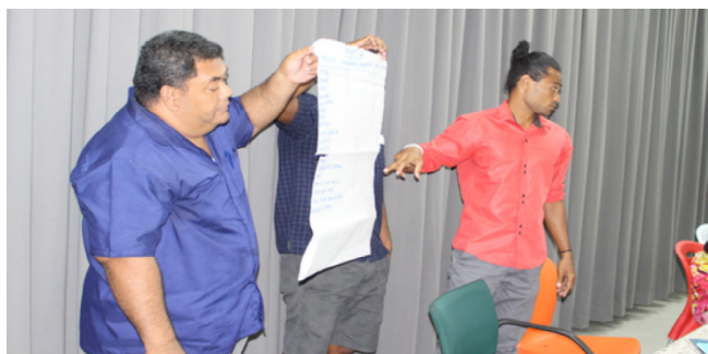
Photo above: SAI Tuvalu staff participants presenting their stakeholders list.