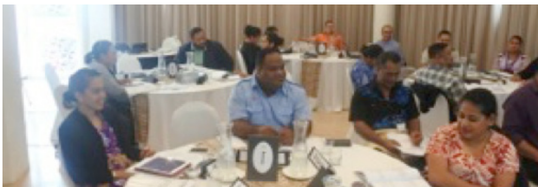
Photo: Workshop participants.

“Strengthened accounting skills and broader public financial management will help build the confidence of both the general public and those wanting to invest in Tonga’s future.”