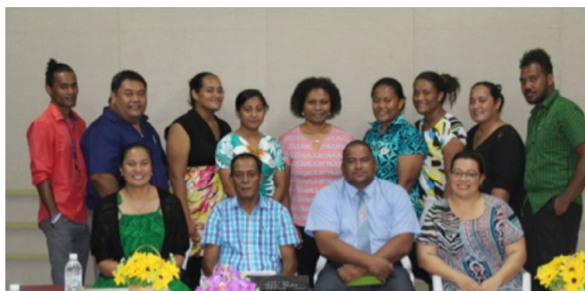
Photo above: Tuvalu SAI staff participants of the Communications workshop, with Auditor-General Eli Lopati (front row, second from the left).