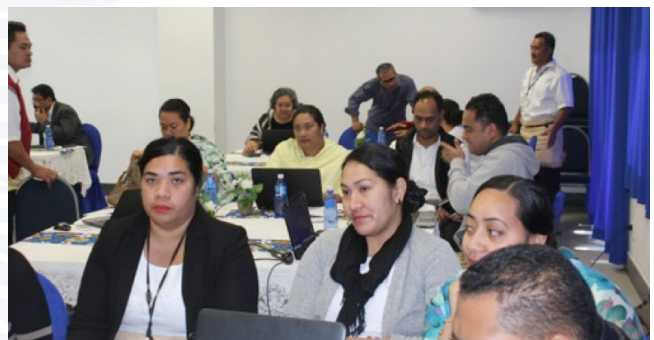
Photos: Participants engaging in the Mapping and iCATs workshop.