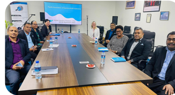
Senior management from SAI Fiji meeting with staff from the PASAI Secretariat and the Office of the Secretary-General