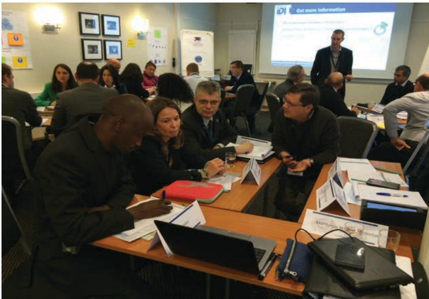
Participants of the IDI Planning and Prioritisation meeting in Oslo, Norway in December 2014

IDI also found the meeting beneficial for obtaining regional perspectives on their proposed programs to assist them design the programs according to the needs of the regions. They have considered suggestions from development partners as well as regional representatives for possible changes in the design of certain programs.