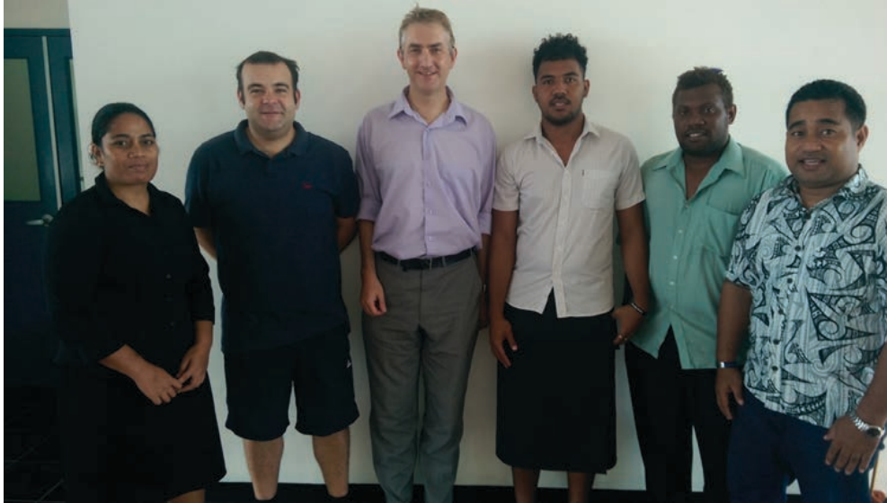
Secondees and ADB consultants for Round 4 of the SAS Program

The SAS Committee will meet in Auckland, New Zealand on 15–16 April 2015 to discuss the Round 4 program report. This report will assist the committee to evaluate and reflect on lessons learnt and to prepare for Round 5 of the program. PASAI acknowledges the continuing support of ADB for this successful capacity building program.