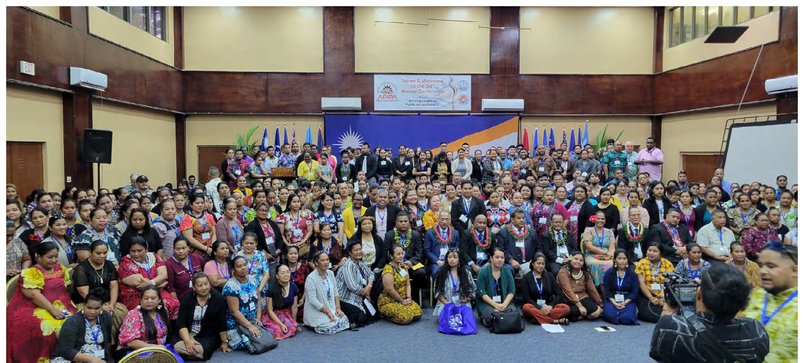
Conference participants

The theme for the conference was “Shining a Light on Public Accountability”. One of the founding principles of APIPA is to promote the use of public resources and strengthen the auditing and accounting profession across its member jurisdictions. Since its inception, APIPA has offered professional and capacity development trainings to its members. A total of 2,190 course certificates were awarded to 406 participants, indicative of 13,804 continuing professional education units being accrued during the conference.