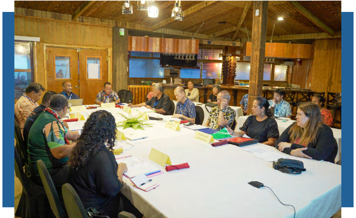
APIPA Principals and other observers at the Executive Body's annual meeting

The APIPA Principals (Executive Body) also held its annual meeting during the week.