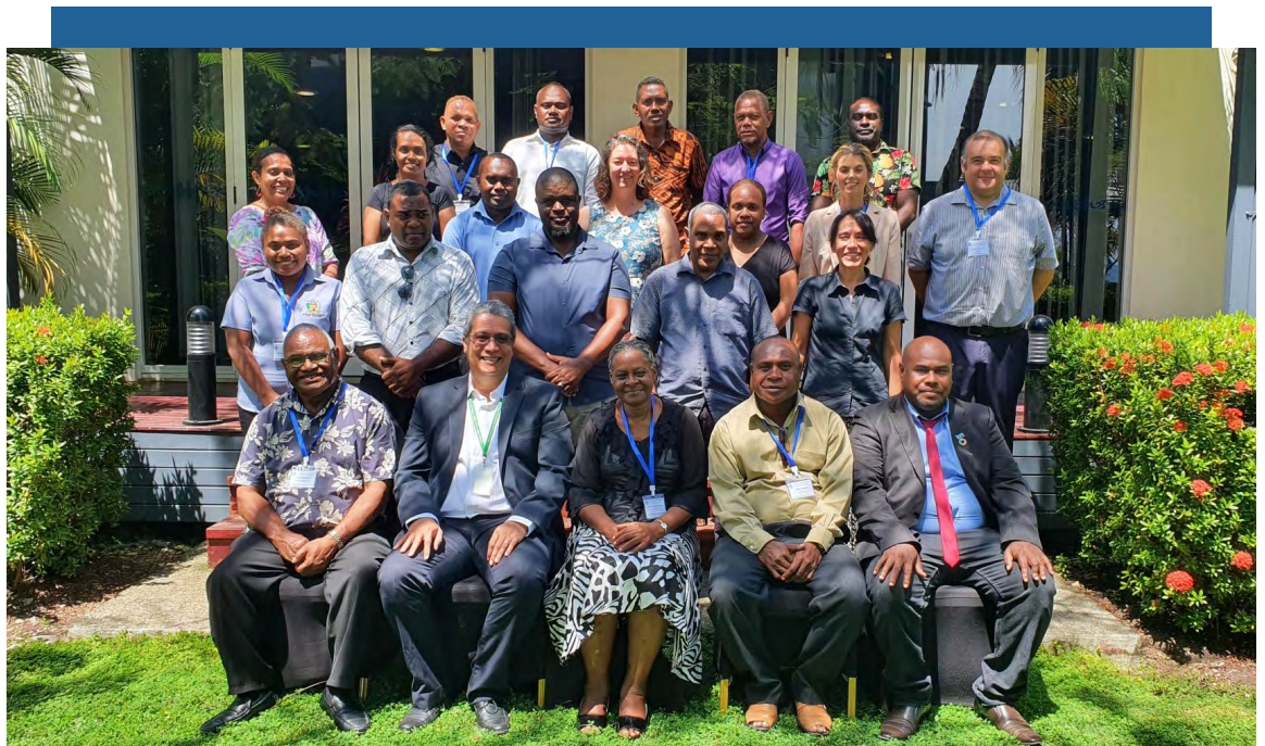
Workshop participants – front row, from left to right: the Ombudsman, the Auditor General, Director of Office of Public Prosecutions, Director of SIICAC and Leadership Code Commission Chair

Attendees included representatives from the OAG, SIICAC, the Financial Intelligence Unit of the Central Bank, the Royal Solomon Islands Police Force, the Leadership Code Commission, the Office of the Ombudsman, the National Parliament of Solomon Islands and various civil society organisations.